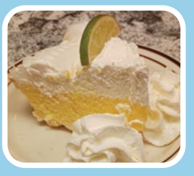
Key Lime Pie