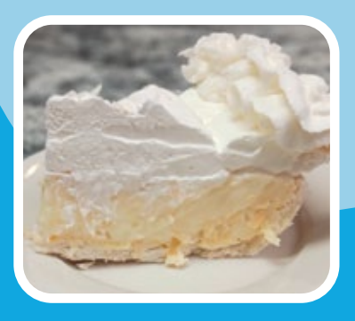
Banana Cream Pie