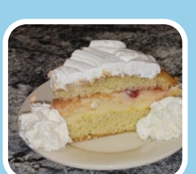
Strawberry Cream Pie