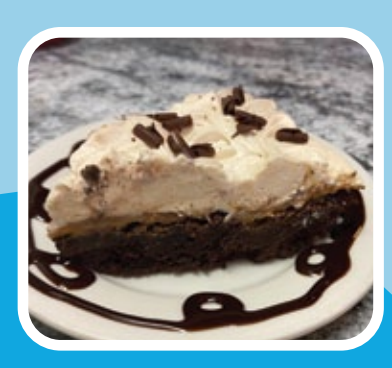
Peanut Butter Brownie Pie